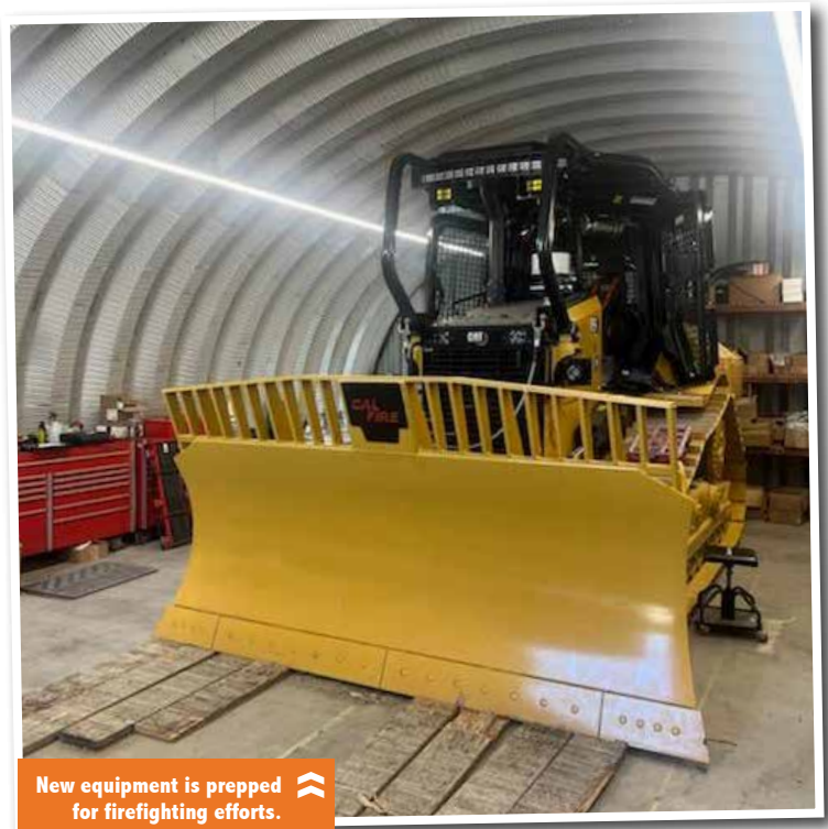
New equipment is prepped for firefighting efforts.

These members are highly skilled and specialized in what they do, and although most people probably don't think of mechanics when they think of firefighting efforts, our firefighters could not do the important work of protecting life and property without them. We thank these members for providing such a vital service to our state and to our communities. We are proud to represent them as part of our union family.