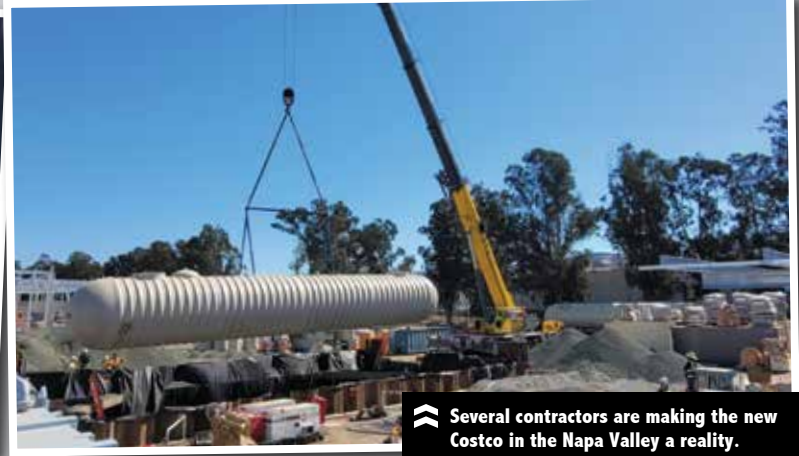
Several contractors are making the new Costco in the Napa Valley a reality.