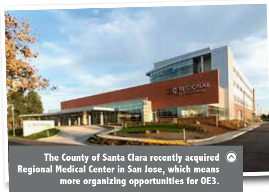
The County of Santa Clara recently acquired Regional Medical Center in San Jose, which means more organizing opportunities for OE3.

Currently, OE3/CEMA has over 380 dues-paying members at Valley Medical Center and the 14 clinics, and after the relatively recent acquisition of O'Connor and St. Louise in 2019, that number increased by 70 more dues-paying members. RMC, with an estimated 1,670 employees and over 500 physicians, has the potential to bring in over 150 members that OE3/CEMA represents, and we would be so proud to grow union strength in a hospital that serves East San José and the surrounding community. Excellence in union work has been a